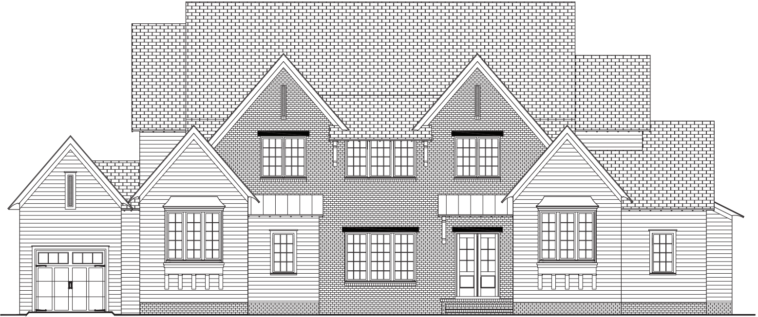
FRONT ELEVATION SCALE: 1/4"=1'

5110 Sq. Ft. Heated Area 4 Bedrooms | 3 Baths & 2 Partial Baths 1st Floor Master | 4 Car Garage